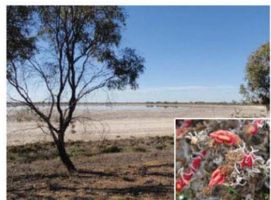
Lake Elizabeth west of Kerang home to a diverse range of native flora and fauna species.